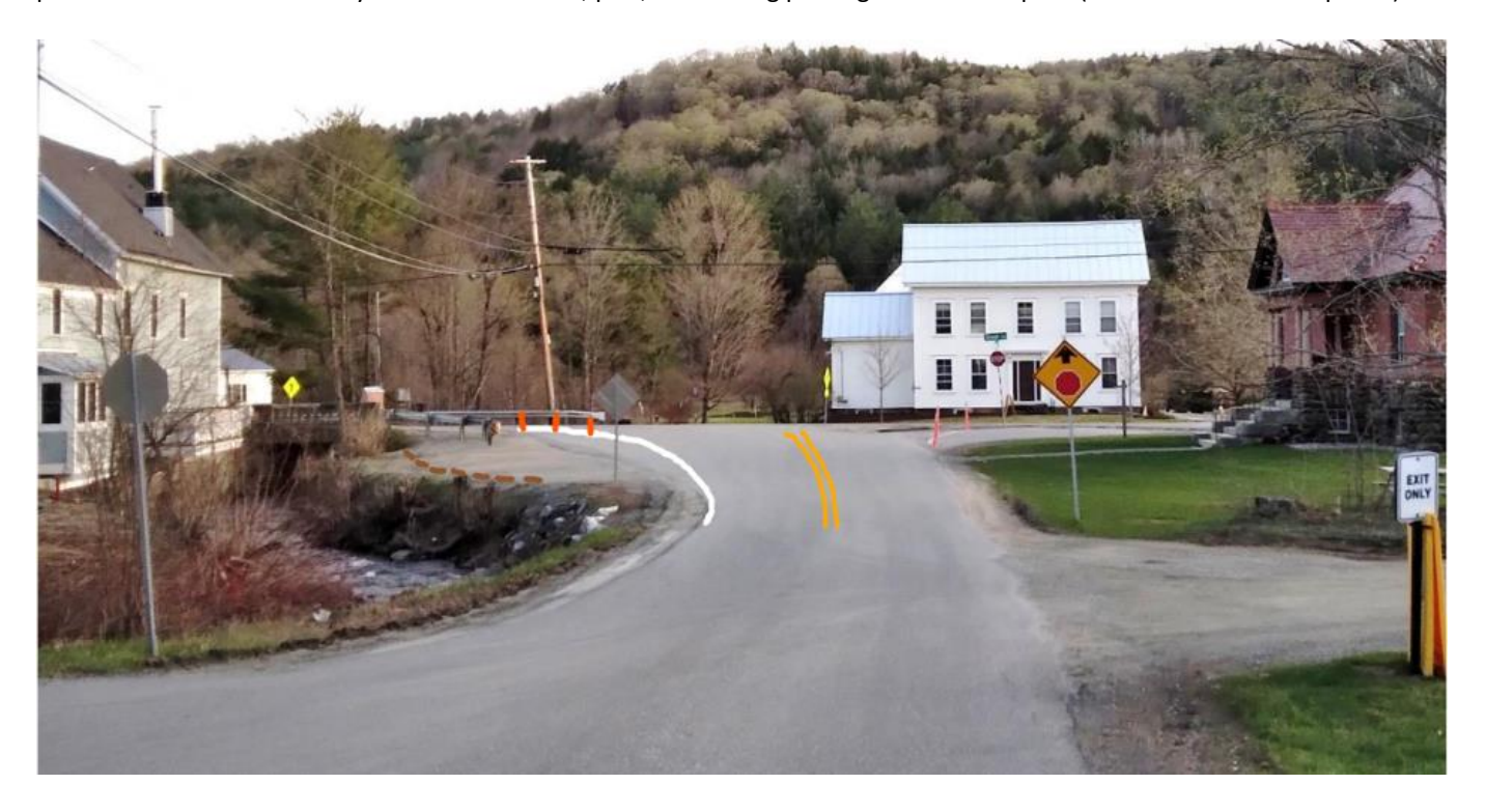
Abbott Library proposed interim changes to parking area & Library Street/Stage Road intersection June 2, 2023 Page 3 of 3

AFTER INTERIM CHANGES: Below is the intersection of Library Street and Stage Road with rough illustration of proposed changes, including painted white line and added orange bollards to move edge of road away from parking area; parking barriers, like railroad ties, to stop people from pulling up too close to the edge of the brook and defining the parking spaces; painted center lines to clearly define traffic lanes; plus, resurfacing parking lot with hardpack (not illustrated in this photo).