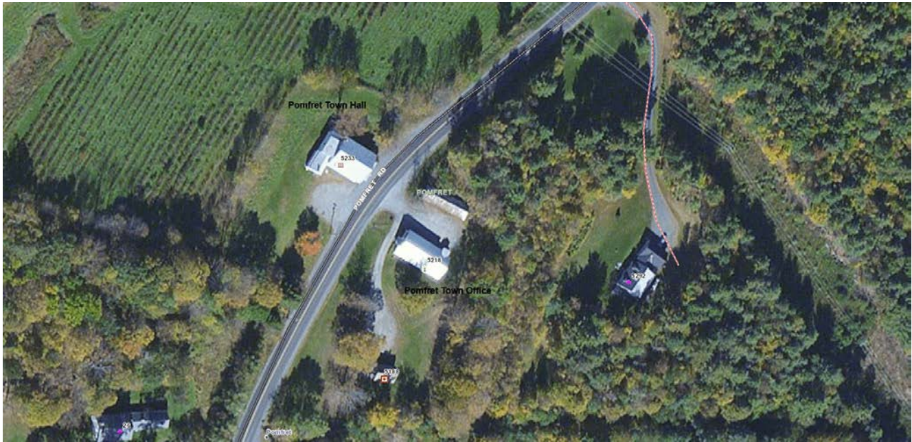
Figure 1 Aerial View of the Pomfret Town Hall and Town Offices i.e. 'the municipal complex'